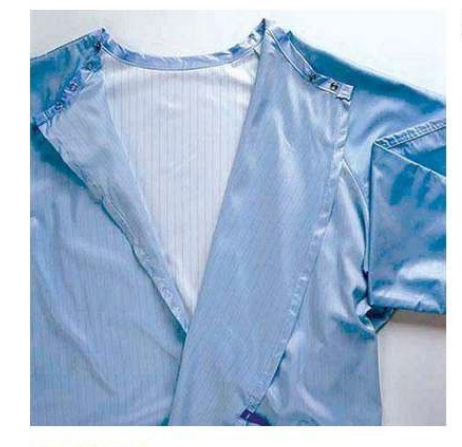
Nancy Jenkins | May 29, 2018 Revelations of cleanroom coverall, isolation and surgical gown life cycle assessments

ARTA says its LCA shows the use of reusable surgical gowns reduces environmental footprint compared to disposables.